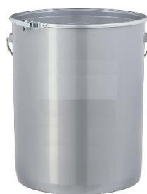
Abb. 2: Hobbock aus Stahl