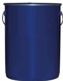
Abb. 1: Hobbock aus Kunststoff